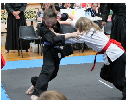
Go Angus – just one more step!!