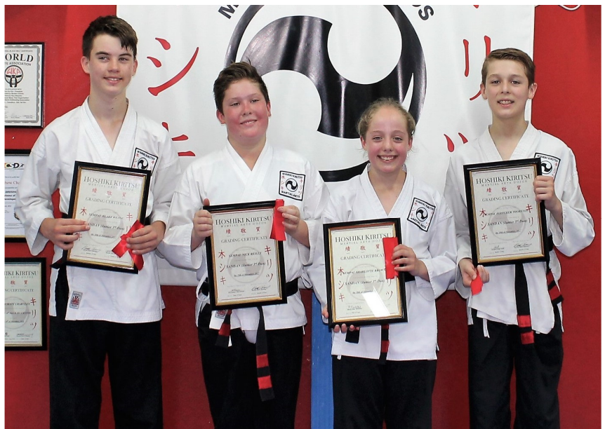
Our new group of Junior 3 rd Dans