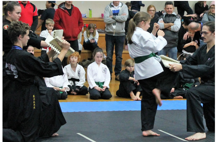
Sienna breaking tiles